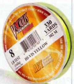
11 Panfish Line