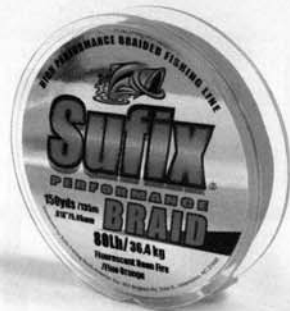
9 Fluorescent Neon Fire Performance Braid

Carolina riggers will find the wrist spool of Carolina Rig Fluorocarbon a handy way to rig up. The German-made line comes in 25-yard leader wheel dispensers and in four sizes from 10 to 25 pound. The abrasion-resistant leader material is made of 100-percent fluorocarbon materials.